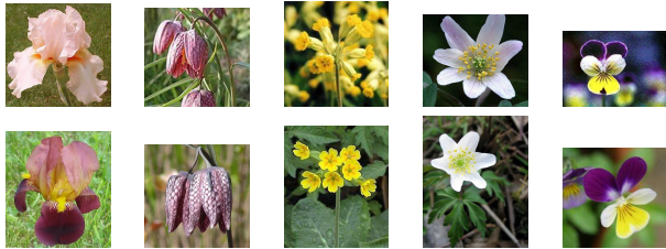
Figure 1. Ten example images from the Flowers dataset. Images in the same column are from the same class.